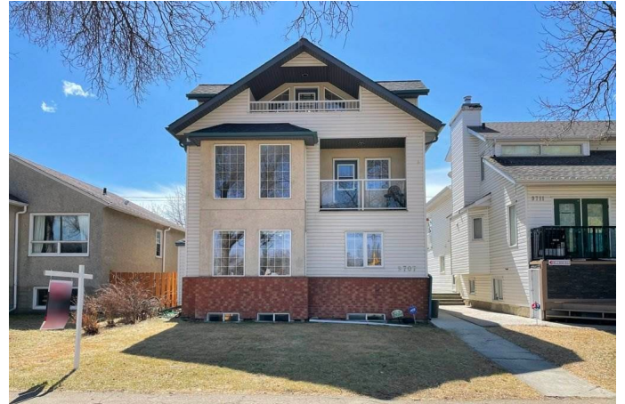
9707 79 Ave NW, Edmonton, AB

MLS® # E4240843 Price $799,000 Bedrooms 6